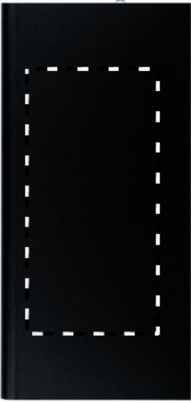
4. BOTTOM PD