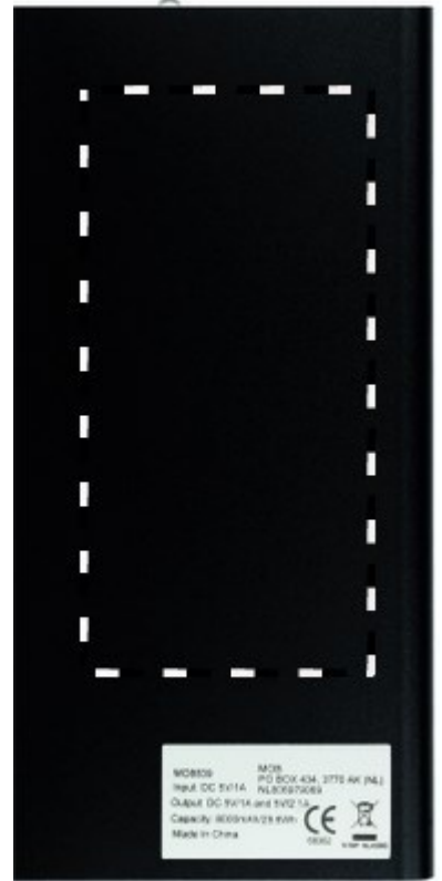
3. TOP PD

MO8839 M39 Input DC 5V/1A NL8097069 Capacity: 800mAh/28.8Wh Made in China