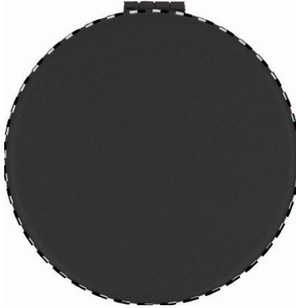
2. TOP PD