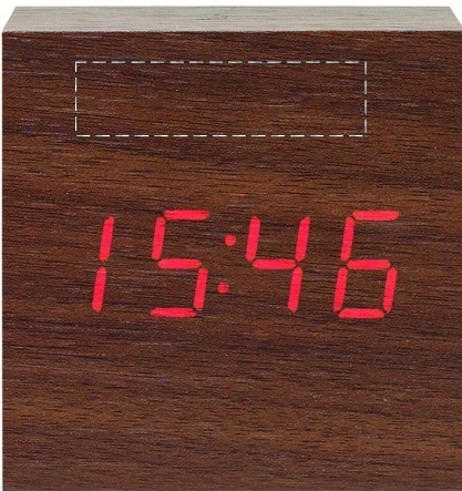
4. UPPER FRONT