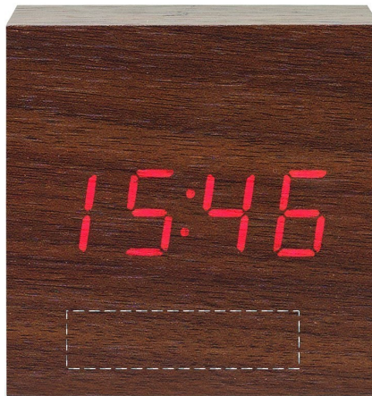
5. LOWER FRONT