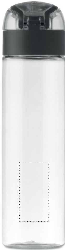
5. BACK BOTTOM