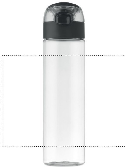
1. ROUND PRINT