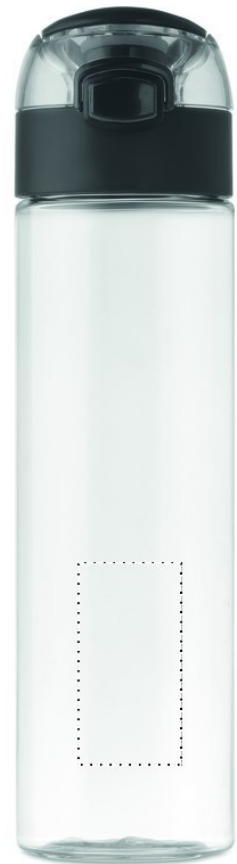
3. FRONT BOTTOM