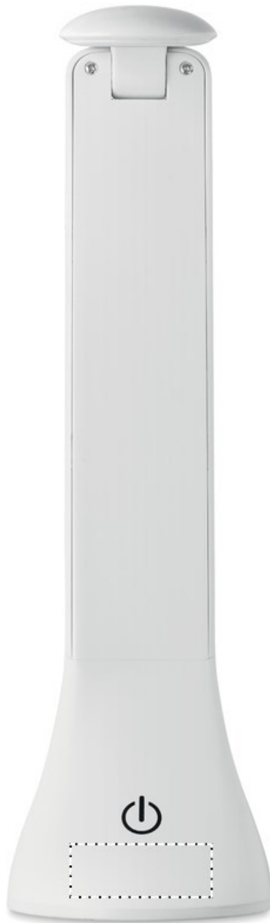
2. BASE BOTTOM