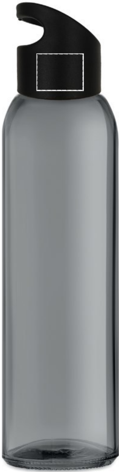
4. CAP SIDE 2