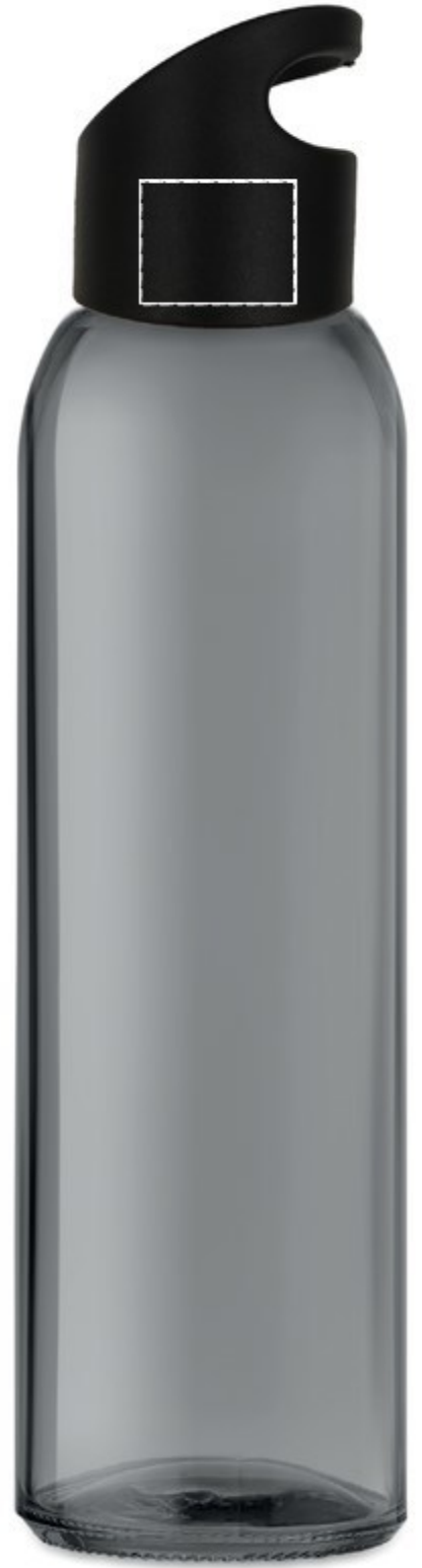
3. CAP SIDE 1